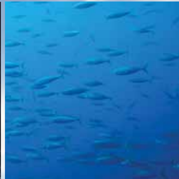
National Marine Fishery Service