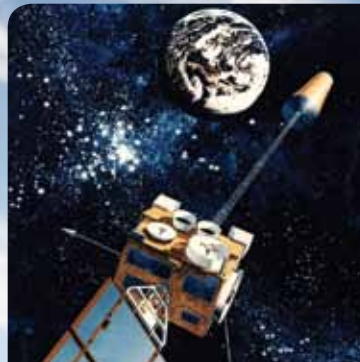
National Environmental Satellite Data and Information Service