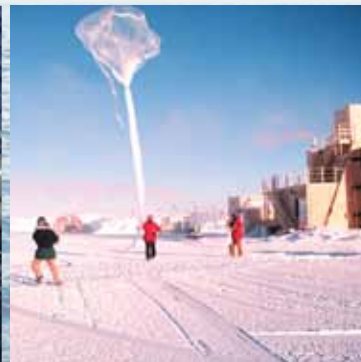
Oceanic and Atmospheric Research Service