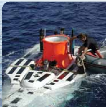
National Ocean Service