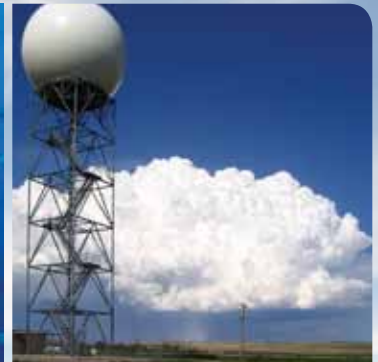
National Weather Service